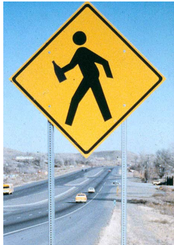
Fig. 2 Innovative Pedestrian Sign

As expected, these rural pedestrian crashes were quite severe, with 99 percent resulting in injury, including 38 percent with fatal injuries. Table B1 in Appendix B shows the percentage distribution of New Mexico’s rural pedestrian crash severity by year. Officers cited “had been drinking” for 33 percent of the pedestrians; see Table B1. This statistic developed from the information on the crash report certainly understates the problem. An earlier research project (7) collected information on actual blood-alcohol levels from the New Mexico Office of the Medical Investigator and determined that the actual alcohol involvement was closer to 60%.