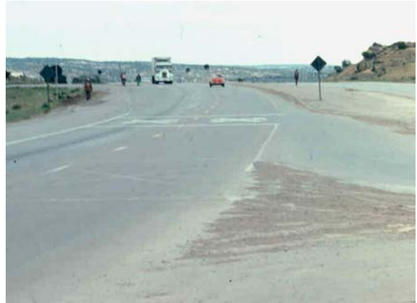
Fig. 11 Rural Pedestrian Concentration

Intelligent Transportation Systems (ITS) and Geographic Information Systems (GIS) technologies show promise for ameliorating vehicle-pedestrian conflicts along rural highways. Innovative ITS methods such as pedestrian detection, relevant warning systems, and dynamic signs are currently deployed in urban areas and could be considered for implementation at selected locations on rural roads (18). The systems allow motorists to detect pedestrians earlier, affording them an opportunity to avoid an impact with a pedestrian or at least reduce the speed at impact. The finding from FARS analyses that 4 percent of rural fatal collisions with pedestrians were associated with a previous accident could be also be addressed by ITS through the prompt detection and clearance of previous incidents/accidents, thus minimizing the opportunity for secondary crashes.