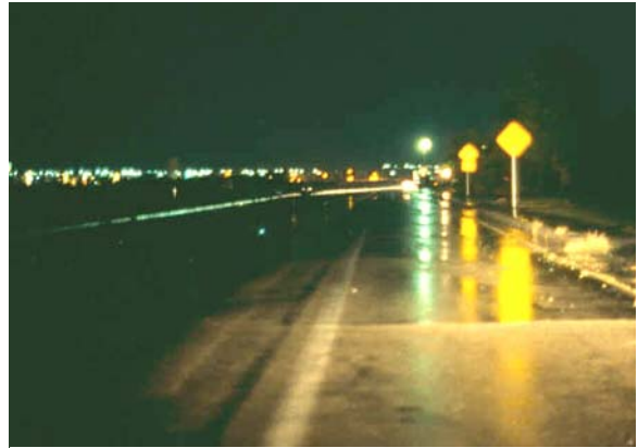
Fig. 7 Rural Road at Nighttime – no overhead illumination

Previous studies have documented that a significant proportion of pedestrian crashes occur during the hours of darkness. For the ten study states, 28 percent of the crashes occurred between midnight and 6:00 am, 16 percent between 6:00 am and noon, 10 percent between noon and 6:00 pm, and 46 percent between 6:00 pm and midnight. There are variations among the study states, as shown by Table A14. Table 4 summarizes the light condition at the times of the fatal pedestrian crashes. Dark, unlighted conditions existed for 64 percent of the crashes; only 20 percent occurred during daylight hours. The table demonstrates that at least 60 percent of rural pedestrian fatalities occur under dark, unlighted conditions in Arizona, California, Louisiana, New Mexico, and Texas. Figure 8 shows the hourly distribution of rural pedestrian fatalities and highlights the particular problem in the evening and early morning hours.