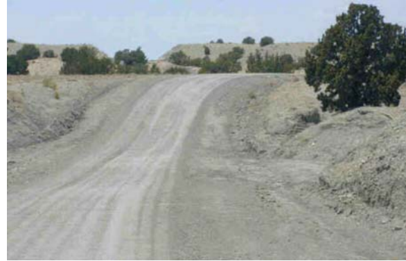
Fig. 3 Typical Low-Volume Rural Road in NM

Among parameters of interest to the engineer, horizontal curvature was cited at 9 percent of the crash locations; this is the same value found in the FARS analysis. As shown in Table B3, the New Mexico values ranged from 4 percent in 1998 to 17 percent in 2000. The reason for this variation is not obvious, but the contingency table analyses rejected the hypothesis that alignment and crash year are independent. Table B4 shows that the profile was level at 88 percent of the crash sites, a result that is also consistent with the FARS analysis.