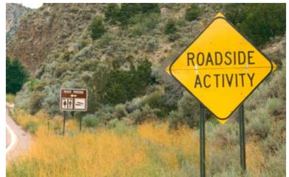
Fig. 10 Typical Pedestrian Tourist Attraction Signing

It is well established that pedestrians overestimate their visibility to motorists during the nighttime. On an unlit roadway at night, a motorist traveling faster than 50 mph with low beam headlights is certainly overdriving the visibility limits, especially where the object that needs to be seen is a pedestrian in normal clothing. The urban solution to this situation is the installation of new