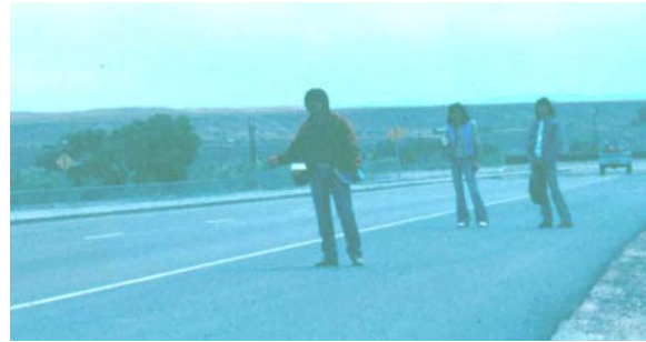
Fig. 1 Hitchhikers along Rural Road

The National Highway Traffic Safety Administration (NHTSA) reports that for 2001, New Mexico's per capita pedestrian fatality rate of 3.94 fatalities per 100,000 population was over 30 percent higher than Arizona's, the second place state, with a rate of 3.00 (2). In 2001, pedestrians accounted for 15.6 percent of the state's highway fatalities, much higher than the national average of 11.6 percent. Over the four-year period 1998-2001, 12.9 percent of the state's fatalities were pedestrians. Because New Mexico is a rural state and pedestrian crashes are more commonly thought to be an urban/suburban problem, it is somewhat surprising that the state's proportion of fatalities involving a pedestrian exceeds the national average.