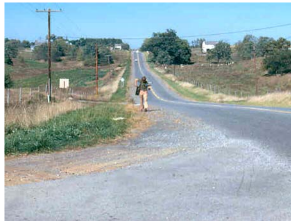
Fig. 1 Typical Road Profile in rural areas – encourages high speeds with no pedestrian facilities.

Most pedestrian fatalities in 2003 occurred in urban areas (72 percent), at non-intersection locations (79 percent), in normal weather conditions (89 percent), and at night (65 percent) (1). The 2003 Fatality Analysis Reporting System (FARS) showed that more than two-thirds (69 percent) of the 2003 pedestrian fatalities were males. One-fourth of all children between the ages of five and nine years old killed in traffic crashes were pedestrians (4). Alcohol involvement for either the driver or pedestrian was reported in 46 percent of the traffic crashes that resulted in pedestrian fatalities. Of the pedestrians involved, 34 percent were intoxicated, whereas the intoxication rate for the drivers was 13 percent; in 6 percent of the crashes, both the pedestrian and driver were intoxicated. Because most pedestrian activity occurs in urban areas, primary attention has been given to the development and implementation of countermeasures in urban areas such as sidewalks, crosswalks, pedestrian signs and signals. However, pedestrian fatality rates are higher in rural areas because of higher driving speeds, which have a greater impact during a crash when compared to crashes on urban streets.