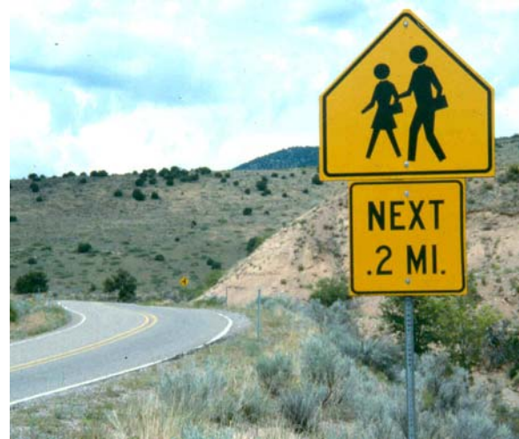
Fig. 3 Typical School Signing in Rural Areas.

Virtually all studies of pedestrian fatalities have found that males are overrepresented based on their proportion of the population. This is also true for rural pedestrian fatalities in the ten study states, where males account for over 74 percent of the fatalities. As shown in Table A5, the percent of male fatalities range from 45 to 82 percent. Particularly in urban areas, considerable attention has been devoted to pedestrian safety for school-aged children. Based on FARS data for the ten study states, this appears to be less of a concern for rural pedestrian collisions. Table 2 shows the age distribution for rural pedestrian fatalities in the study states. On the average in these states, pedestrians under the age of 16 account for about 8 percent of the rural fatalities, while those over the age of 64 account for about 13 percent. There are multiple indications from previous studies (7) that alcohol involvement is underreported in rural pedestrian crashes; hit-and-run drivers make it impossible to obtain this information, and it appears that investigating officers may be reluctant to report pedestrian alcohol involvement. Indeed, investigating officers report “unknown”, “test refused”, or “blank” for alcohol involvement for 44 percent of rural fatal pedestrian collisions in the study states. In the minority of crashes where the officer cites an opinion, over 32% of crashes indicate alcohol involvement, (as shown in Table A6).