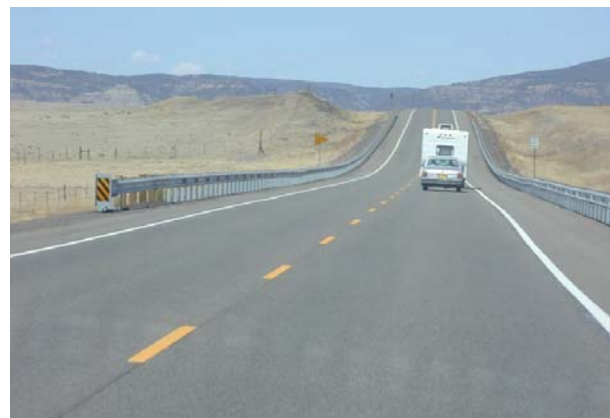
Fig. 5 Straight-level roadways where close to 90% of all rural pedestrian crashes occur.