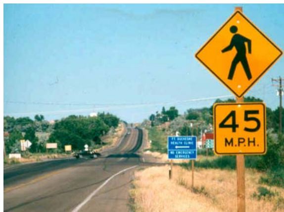
Fig. 6 Pedestrian with Advisory Speed

One primary factor in fatal pedestrian accidents is the speed of the impacting vehicle. This is rarely available in the crash records, but the speed limit, which might be considered as a surrogate for roadway travel speeds, is included in the FARS database. The reported speed limits at the rural sites of pedestrian fatalities ranged from 50 mph to 75 mph. The speed limit range 55 to 60 mph accounted for 34 percent of the crash sites, and an additional 28 percent had speed limits of 65 mph or more. Speed limits were 40 mph or less at 23 percent of the sites. Table A13, shows that 40 percent of FL, MT, NM and OR rural pedestrian fatalities occurred on roadways with posted speed limits of 40 mph or less.