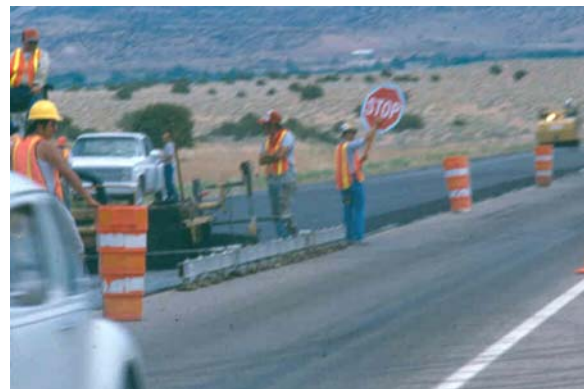
Fig. 2 Typical Work zone with limited worker protection

The characteristics discussed in this section address some general concerns about rural pedestrian fatalities that are relatively consistent among the states and, in many cases, beyond the control of the engineer. Approximately 18.3 percent (range 7 to 30 percent among the ten study states; see Table A2) of the pedestrian fatalities involved hit-and-run drivers. The most important consequence of this sad statistic is that motorist information is unavailable for one-sixth of rural pedestrian crashes. Table A2 also shows that school buses are associated with only 0.4 percent (range 0 to 1.0 percent) of these fatalities, which suggests that pedestrian safety in the vicinity of rural school bus loading zones is very good. Considerable attention is being devoted to traffic safety in construction zones, and rightly so, but only 2.2 percent (see Table A2) of these fatalities occur in construction areas. In conventional thinking, a pedestrian collision involves a single vehicle impacting a single pedestrian. In fact, specific rural crashes in the ten study states included a couple involving six or seven vehicles. Among all rural fatal pedestrian crashes in the