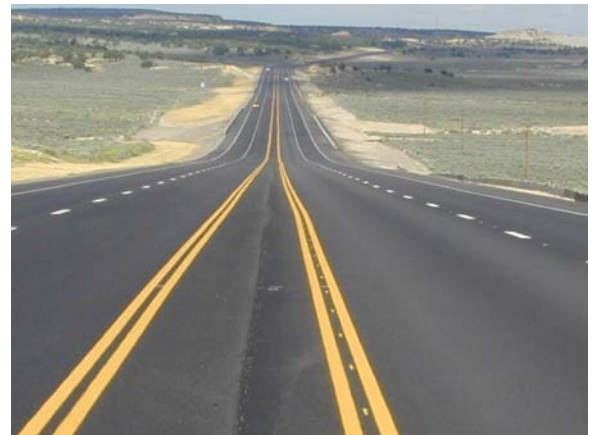
Fig. 9 High-Speed Rural Road (38% of rural pedestrian fatalities occur)

The critical period for rural pedestrians in the ten study states was between 6pm and 6am, which accounted for 73 percent of the fatalities. Related statistics from Table 4 show that 64 percent of the rural pedestrian fatalities occurred on dark, unlighted highways and an additional 12 percent occurred on lighted roadways during the hours of darkness. Evidently, limited visibility plays a major role in the occurrence of rural pedestrian fatalities. But in most cases, the situation does not lend itself to correction through standard programs of sight distance enhancements such as improving horizontal or vertical alignment. The incidence of impaired driving is also known to peak during the hours of darkness, further exacerbating the situation.