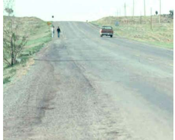
Fig. 4 Unpaved shoulders provide space for pedestrian to walk, but don't offer physical protection

Crash frequency is known to vary by day of the week and month, but the engineer can control neither. Nevertheless, Saturday (21 percent) accounts for the greatest proportion of rural pedestrian fatalities, while Monday (10.7 percent) has the least. The commonly accepted weekend period, Friday through Sunday, accounts for half of these fatalities (53 percent). The results by state are given in Table A7. If all months accounted for equal shares, then each month would experience 8.3 percent of the annual rural pedestrian fatalities. Overall, months in study states range from a low of 6.6 percent in May to a high of 11.8 percent in September. Table A8 shows the monthly distribution of pedestrian fatalities for the ten study states.